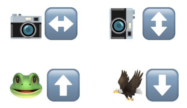
Figure 2. Visual Literacy Emojis card depicting using the camera vertically or horizontally or a frog's-eye view versus a bird's-eye view.

Participants were allocated one hour to capture the prompts listed above and given a Visual Literacy Emojis card to help them remember the various elements that make up an image. Using an Emojis card helped reduce misunderstanding of the topics presented because of the language barrier. Ukrainian students worked in pairs to develop concepts and photograph each other when their concept required a portrait.