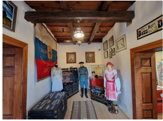
Photo 3: Museum of Slovak Diaspora "Kasigarda", Pavlovce nad Uhom, Slovakia.