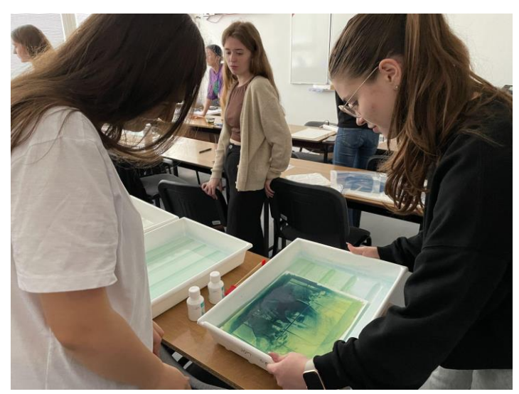
Figure 3. Workshop participants are developing an exposed cyanotype in a tray of water.

Participants then followed the photographers of the past by placing the digital negative on top of the coated paper and then exposing them to direct sunlight or under an ultraviolet light source for a certain number of minutes, depending on the density of the negative and intensity of the sun. The exposed paper is placed in a tray of tap water for the development process, and a few drops of hydrogen peroxide can be added to speed up the oxidation process and intensify the cyan color of the image.