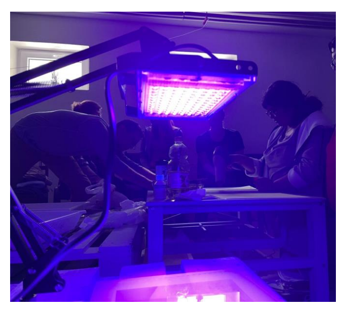
Figure 4. An ultraviolet lamp exposes the image during cloudy or rainy days when sufficient sunlight is unavailable.