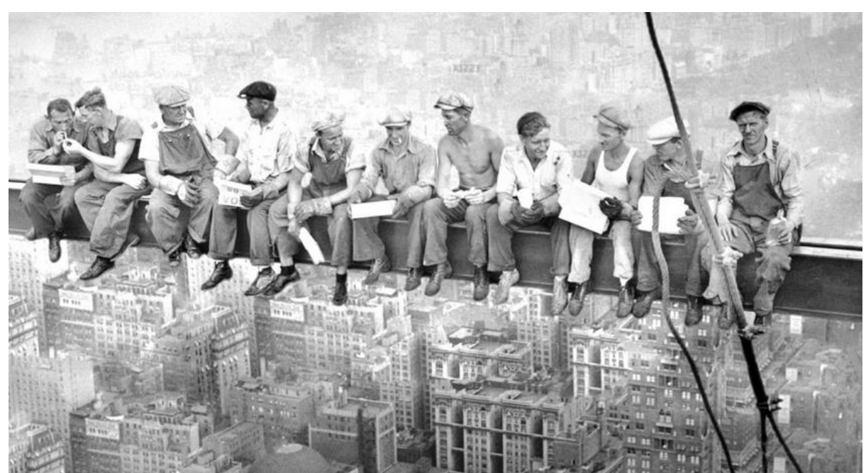
Photo 1. Lunch atop a Skyscraper.

Lunch atop a Skyscraper (see photo 1) is perhaps one of the most iconic photographs of 1930s Manhattan, New York. It was plausibly called "a piece of American history" (Johnston, 2022).