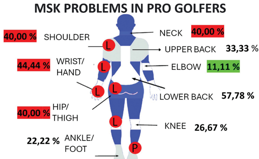
FIGURE 2. Musculoskeletal problems in PRO golfers

25%—55%)). In PRO golfers, the occurrence of MSKP in all body parts was on the left side, except the ankle/foot, where the right side predominated (fig. 2).