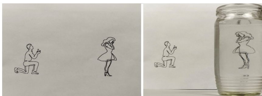
Figure 4. Representation of a young couple (a) without a jar, (b) using a jar Author: Natália Demianová [16]

In this activity, we will use a jar as a lens with which to create images of objects printed on paper. The essence of the activity is an experiment that appears quite often on social media, and the task of the activity is to explain the observed phenomenon. Again, there are two versions of the worksheets (Figure 4).