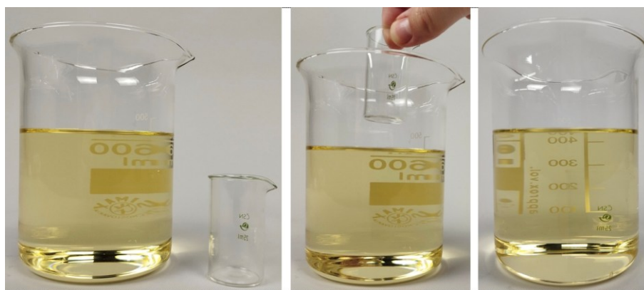
Figure 1. Disappearance of the beaker in vegetable oil [16]

The essence of the activity is an experiment with simple tools: vegetable oil and two beakers of different sizes or glass balls. The experiment is easy to carry out. After placing the smaller beaker (ball) into the larger one, the oil is slowly poured into it and the pupils watch the beaker/ball slowly disappear (Figures 1 and 2).