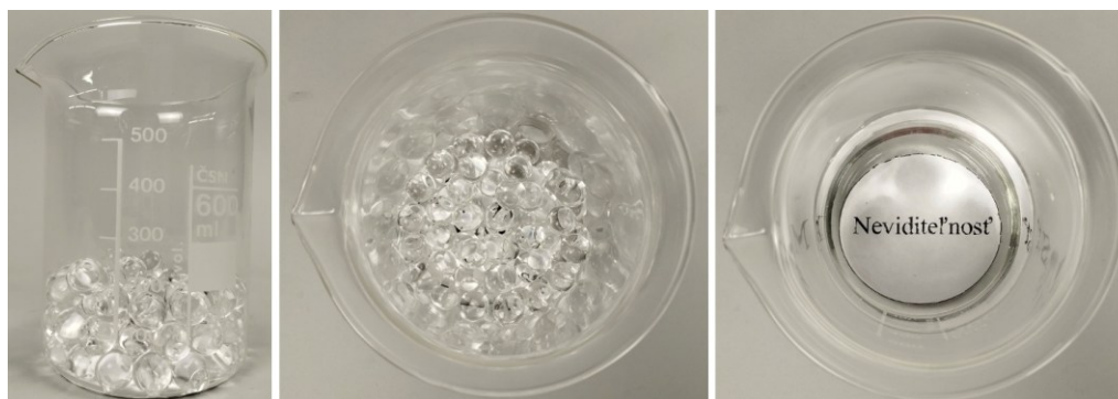
Figure 3. Hydrogel small balls a) without water and b) in water Author: Natália Demianová [16]

The activity deals with the same physical phenomenon as the previous activity, except that hydrogel small balls are used instead of glass balls. The hydrogel balls can absorb a larger amount of water, which increases their volume several times. Pupils may be familiar with them as they are often used in various floral decorations (Figure 3).