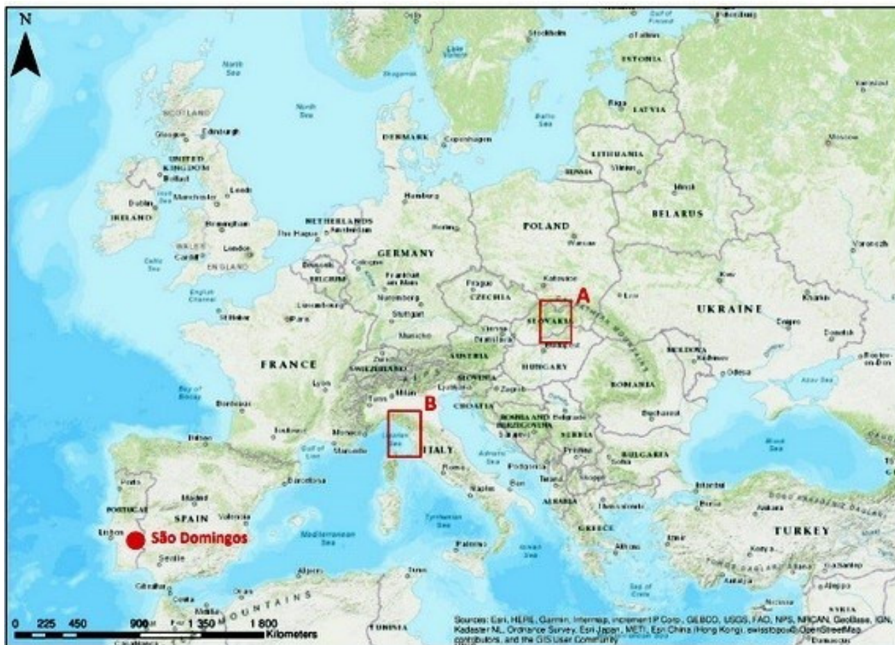
Fig. 1. Localization of the studied Cu-deposits (A - Špania Dolina, B - Caporciano, Libiola)

The identification of the bioavailability of selected PTEs was studied by sequential extraction procedure [8]. At first the analyzed sample was dried at 60 °C for 24 hours. 1 g of sample in 50 ml falcon tube was extracted using 5 extraction solutions: The ICP-MS analyses were realized in laboratories of TU-Bergakademie Freiberg. The analyses took the place in the laboratories of Biowissenschaften at TU-Bergakademie Freiberg (Germany). The total concentration of PTEs was measured using 100 mg of sample dissolved in aqua regia. For the sequential extraction analysis was used 1 g of technosol sample. Four steps of sequential extraction was executed: I. distilled resp. deionized water; II. 1M solution of \text{NH}_4\text{CH}_3\text{CO}_2 (ammonium acetate) at pH 7; III. 0.01M \text{C}_6\text{H}_8\text{O}_7 (citric acid) solution. First 2 fractions can be considered as exchangeable [9].